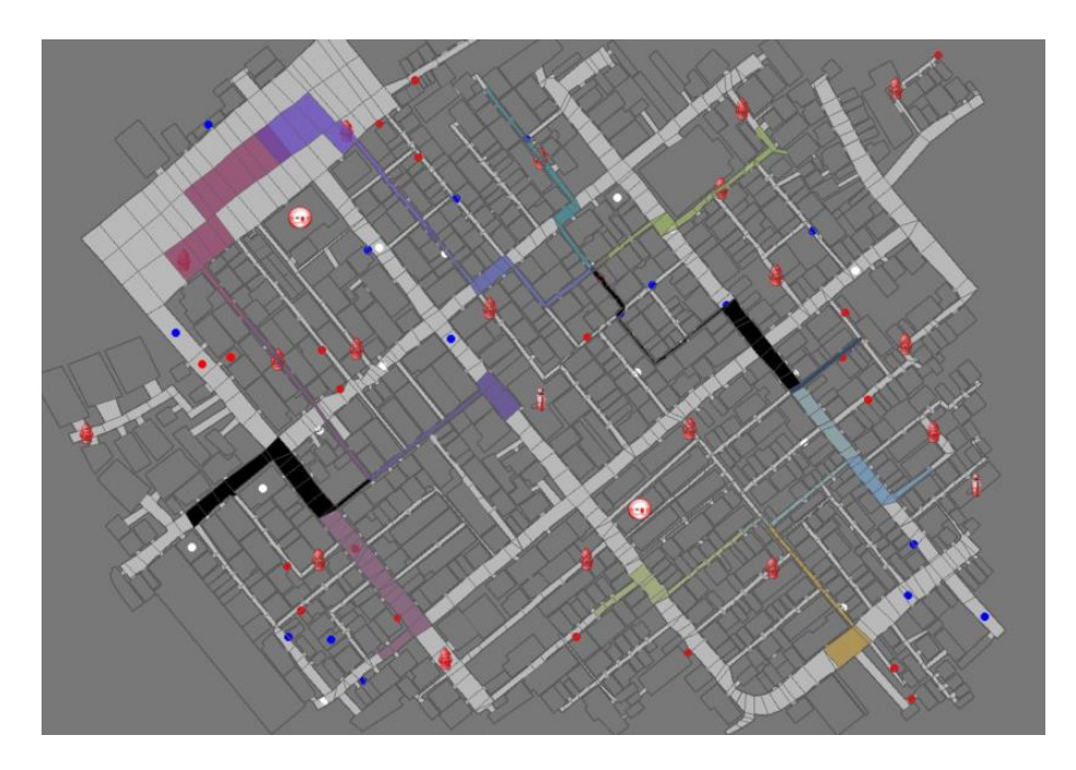
Fig. 1: MST and the share of each Police force

2.1 Police Force Police forces have the ability to clear paths, open the entrance of buildings and free stuck agents. So in spite of the fact that Police forces operation does not effect on the score directly, the performance of other agents is highly dependent on them. In this section S.O.S team's methods are described that are used to handle each of Police forces major tasks: 2.1.1 Making most parts of the map reachable Each police is given one cluster in order to prevent them from wasting time on traversing paths that are already cleared by other PFs and clear more paths in less time totally. According to that, the need for agents to have access to most parts of the map is met by connecting the center of police clusters to each other by a "minimum spanning tree" on the center of clusters. Each PF is responsible for clearing one edge of the tree and the allocation is done in the precomputation phase (Fig.1). After that PFs start connecting important points of their cluster to this MST in order to expand the accessible area.